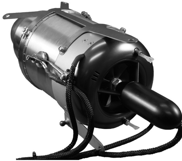
figure 1: engine