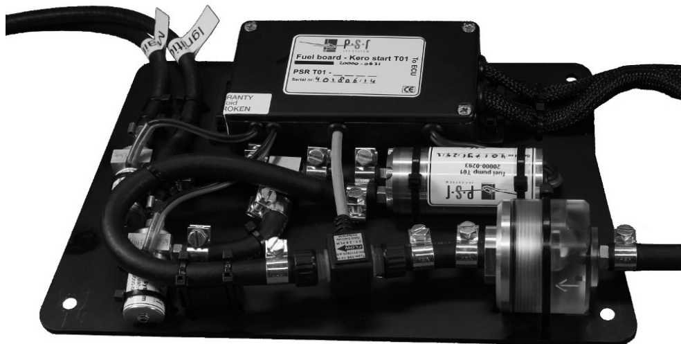
figure 4: engine fuel board