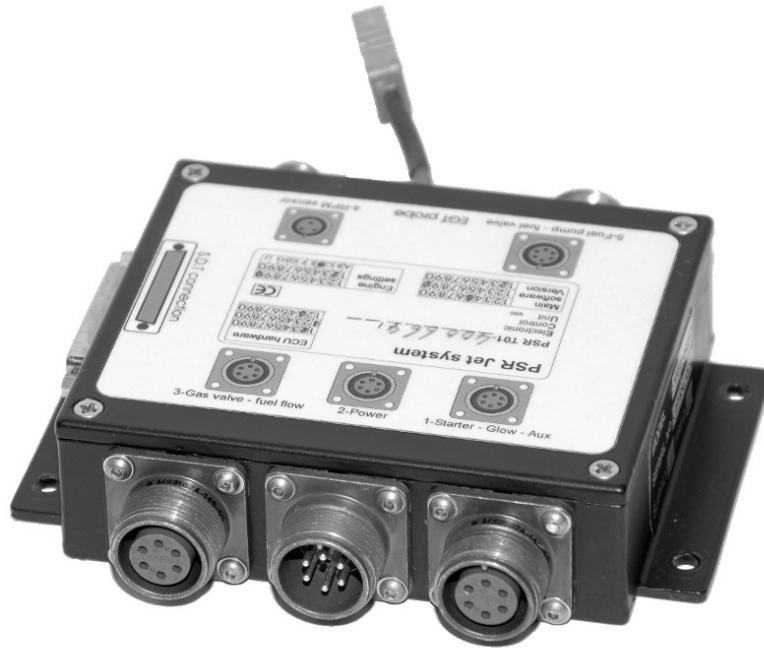
figure 3: engine control unit